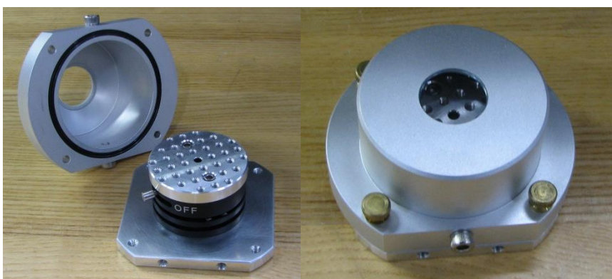
Figure 1. Gasket mounting plate and assembled canister.

Users will prepare gaskets for drilling in the fume hood of 434E-030. Pre-indentation of the gaskets must be done there, or with Kapton tape covering all the holes in the DAC or encapsulating the gasket in case of cracking of the Be as pressure is increased. Once the gasket is ready to be drilled/machined, it must be mounted in a dedicated air-tight canister (see Fig. 1) which is then sealed. At this point the exterior of the canister has to be cleaned by a thorough rinse of isopropanol and wiped with a Kim-wipe to prevent transport of Be dust to outside of Be area. Then the canister has to be transported from the Be fume hood to the laser drill and bolted onto the drilling stage (see Fig. 2). Laser drilling/micro-machining should be performed according to the laser drilling SOP, with the caveat that the canister never be opened while at the laser drill and all alignment and drilling is done through the sapphire window permanently mounted in the top of the canister.